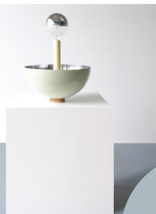
Simply Cool The sleek and minimalist Table Light Spectacular (above); Peet's rustic Hanging clock.