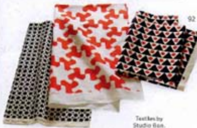
Textiles by Studio Bos.